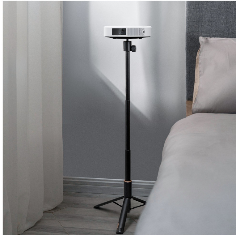
▲ Floor Stand Mode